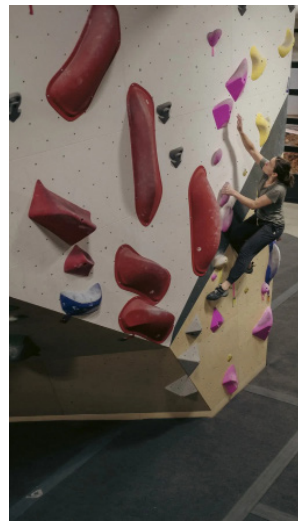
High Point Climbing Gym