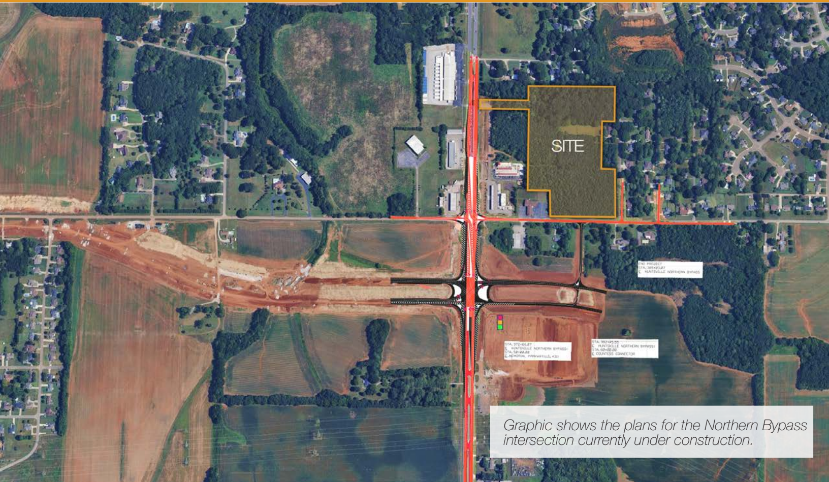
Graphic shows the plans for the Northern Bypass intersection currently under construction.