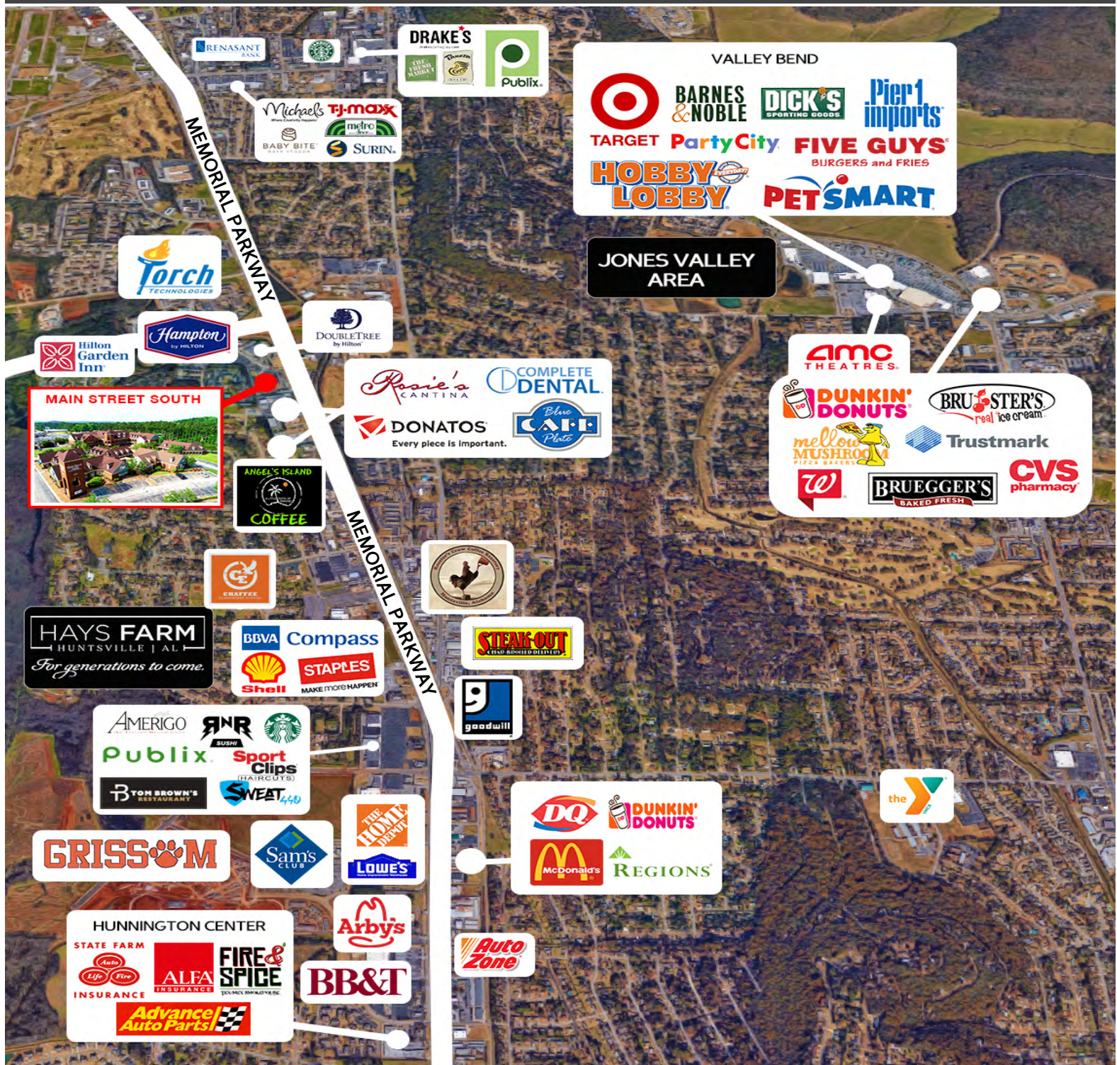
PHOTOS OF MAIN STREET SOUTH