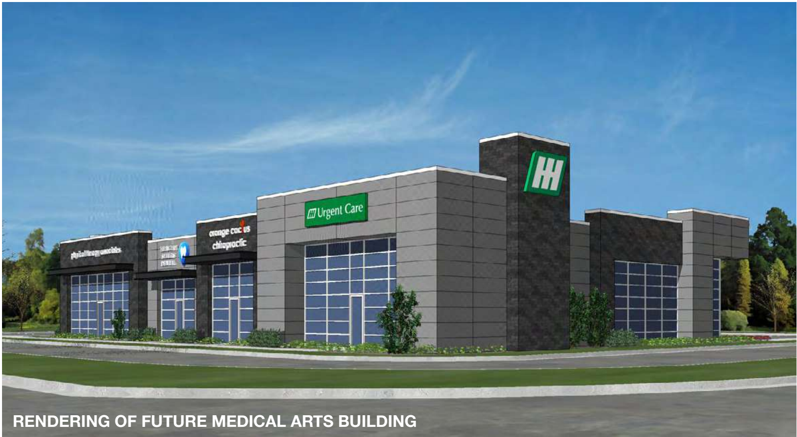
RENDERING OF FUTURE MEDICAL ARTS BUILDING