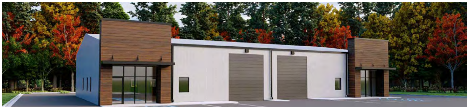
POTENTIAL BUILD FOR CONSTRUCTION