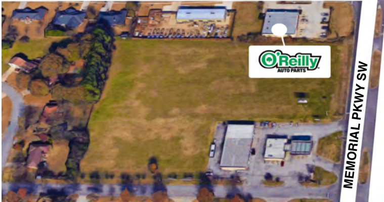
MEMORIAL PKWY SW