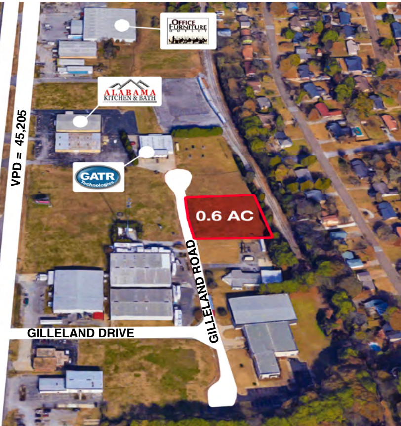
VPD = 45,205