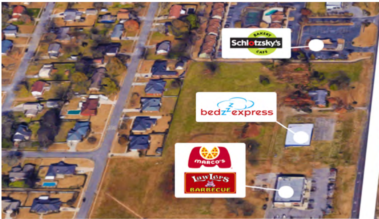
MAGNA CARTA PLACE